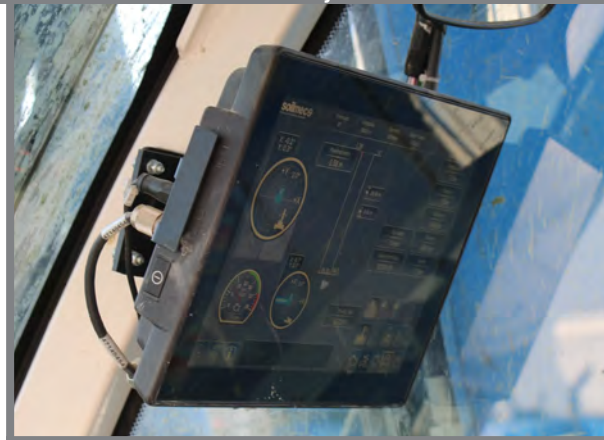
DMS On Board control system