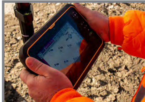
Pile location control system